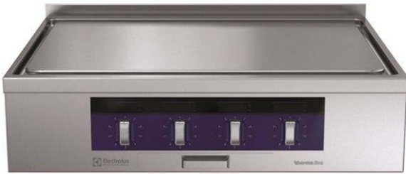
588010 (MALDABHOAO) Electric solid top, 4 zones, ecotop coating one-side operated with backsplash